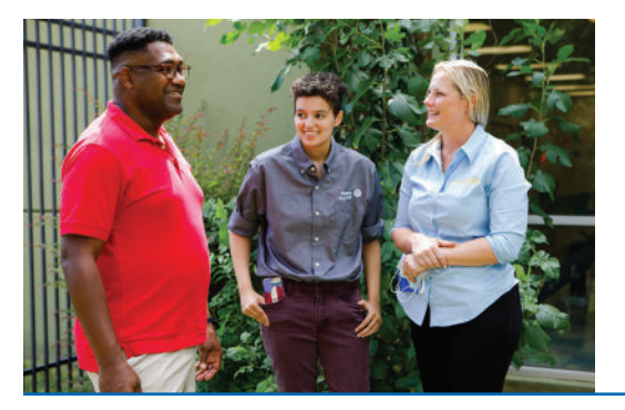
Clubs are most successful when they reflect the community they serve.

Clubs are encouraged to reflect the diversity of their communities by including members from a mix of professions, genders, ages, and ethnicities. Having members with different backgrounds and viewpoints gives your club a broader understanding of the community and its problems and better equips it to find solutions. Equally important is fostering a culture of inclusion in which these differences are respected, supported, and valued. Visit rotary.org/dei to learn more.