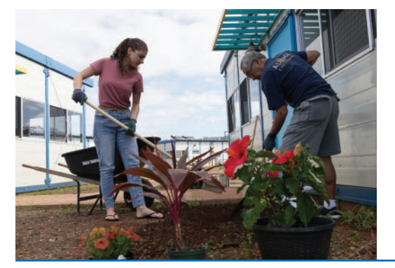
Rotary members and members of the community come together to serve.

A Rotary Community Corps (RCC) is a Rotary club-sponsored group of nonmembers who want to help their own community through service projects. Rotarians provide professional expertise, guidance, encouragement, organizational structure, and some material assistance to the RCC, whose members contribute their labor and knowledge of community needs. This community-based service program was initiated in 1986 to improve the quality of life in villages, neighborhoods, and other communities.