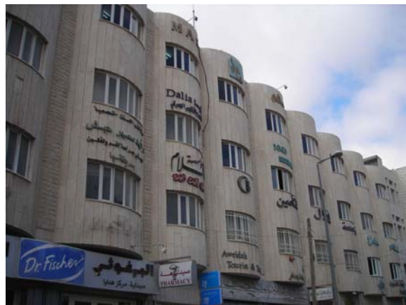
My office in Ramalah.