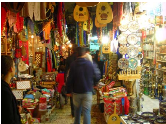
Crowded market streets of the old city.