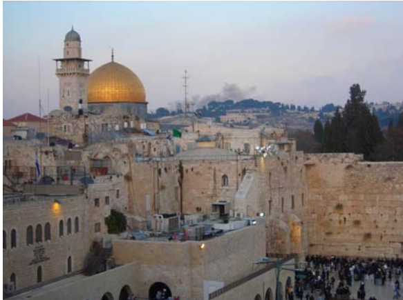
The Golden Dome in the center of Jerusalem with the Western Wall in the foreground.

PS. Keep up the good work on the water filters!