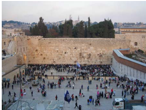
The Western Wall.